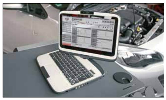
Rotatable monitor for use as a touch screen or with keyboard